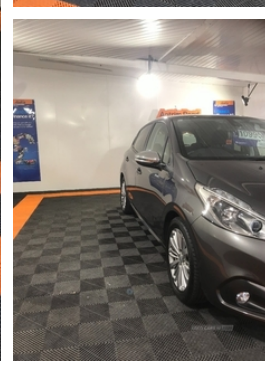
** VERY LOW MILEAGE VEHICLE ALERT **

DUE IT'S FIRST MOT IN SEPTEMBER, WE WILL MOT THE VEHICLE FOR IT'S FIRST YEAR